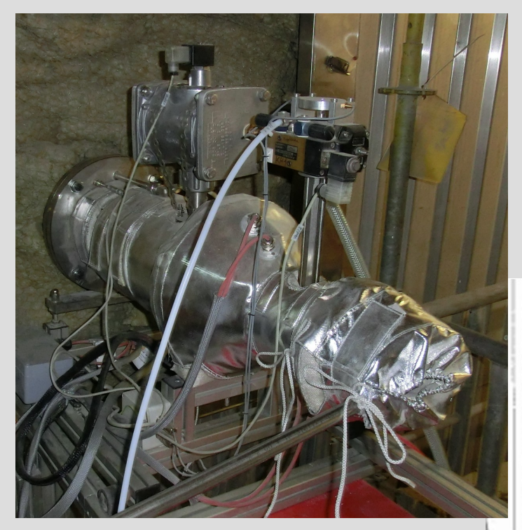
(top) filter probe with heating modules up to 200\ ^{\circ}\text{C} - (below) filter sample is placed between the filter bags through flange